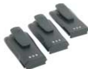
High Capacity Li-Ion Battery, Slim Li-Ion Battery and NiMH Battery - NNTN4497, NNTN4970 and NNTN4851